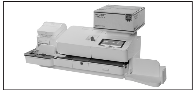
Pitney Bowes SendPro C Auto

CONTACT: For more information call 1-800-350-6450 or email sales@eii-online.com .