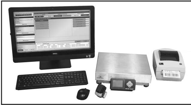
Engineering Innovation's Super Champ

CONTACT: To learn more about Tritrek call 302-223-4065 or visit www.tritek.com or email solutions@tritek.com .