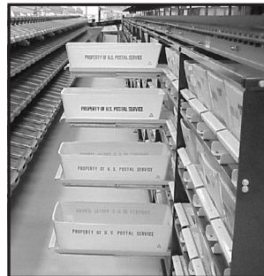
Sorter Tray Racks

DESCRIPTION: The PostalOne® System provides the capability to scan bar code labels, weigh mail trays and tubs, and print Dispatch & Receipt (D&R) labels for manual or automatic application (depending on configuration). D&R labels