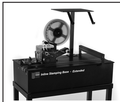
Postmatic Inline Stamp Affixing System

INLINE STAMP AFFIXING SYSTEM: The Postmatic Inline Stamping Base-Extended offers the versatility of attaching an inkjet system making a perfect solution for affixing stamps and ink-jet addressing inline while inserting. Perfect for Read and Print Applications and almost any ink-jet system may be added.