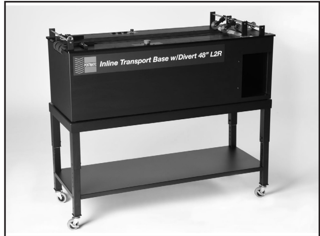
Postmatic Inline Divert System

RELIANT INSERTER FEEDER: Streamfeeder's Reliant Inserter Feeder is designed for 6x9 swing-arm inserters. It combines flexible performance and variable speed with superior feeding capabilities while precisely separating,