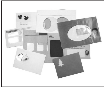
Supremex Custom & Stock Envelopes

tainable packaging that gets the job done with the least possible environmental impact. FOLDING CARTON: We provide CPG, Pharmaceutical and Food brand owners and co-packers with premium quality, gorgeously decorated paperboard folding cartons for retail applications. Our folding carton solutions are based on innovative design, worldwide paperboard sourcing, state of the art traditional and UV lithographic printing and coatings, high speed blanking and consistent and reliable folding and gluing.