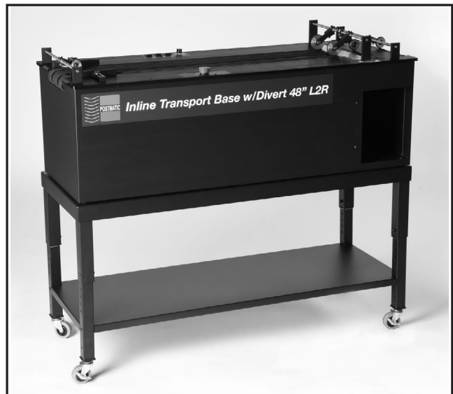
Tritek Oasis Digital E-Mail Delivery Sorter

CONTACT: To learn more about Tritetek call 302-223-4065 or visit www.tritek.com or email solutions@tritek.com .