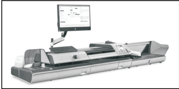
Quadiant iX-9 with S.M.A.R.T.

even the heaviest parcels and over-sized packages. An optional dynamic scale accurately weighs, rates and classifies mail at speeds up to 160 lpm /180 lpm (postcards).