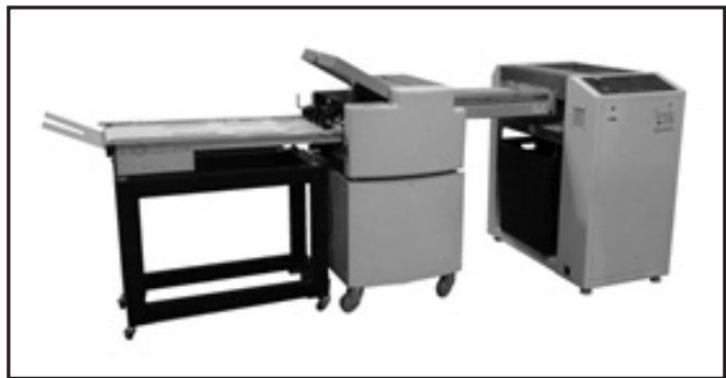
Spedo OPERAM Pressure Seal Solution