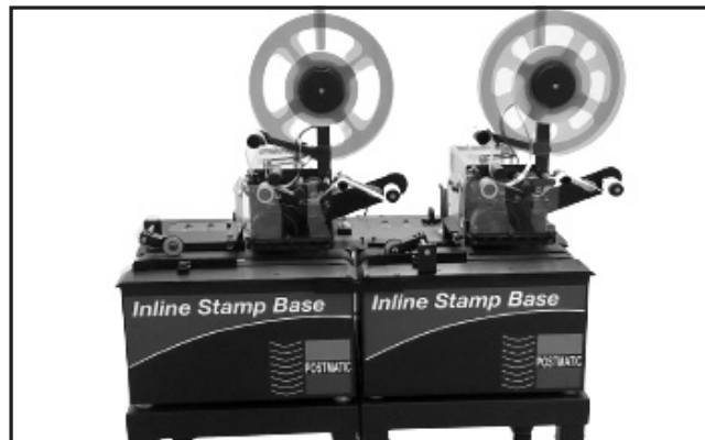
Postmatic Inline Stamping System