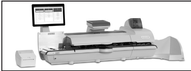
Pitney Bowes MailCenter 2000 Mailing & Shipping System