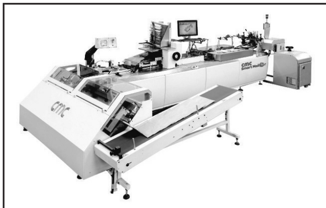
Bell and Howell Smartmailer

the end-of-process JETVision® camera system to ensure 100% integrity.