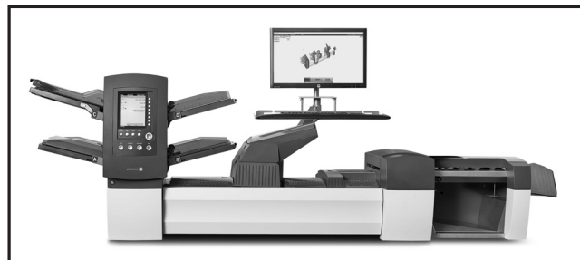
Relay® 5000 Folder Inserter

CONTACT: To learn more visit bellhowell.net or call 800-961-7282.