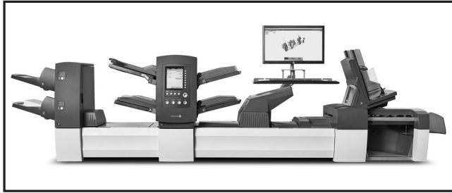
Relay® 8000 Folder Inserter

to mid volume mailers to bring you increased speed, flexibility and precision. This inserter folds, inserts and seals up to 62,500 a month with throughput of 4,000 envelopes per hour. We know your customers' privacy and security is critical. The optional file control is a proven Pitney Bowes technology version of file-based processing that goes beyond traditional OMR or 1D and 2D barcodes scanning by using a Reference File to control the folding and inserting process. You can track not only what pages are being folded and inserted, but also which specific pages are intended for each individual customer, giving you the capability to recreate a mailing event at a personalized recipient level. Achieve greater levels of accuracy, security and speed with the Relay 5000 inserting system.