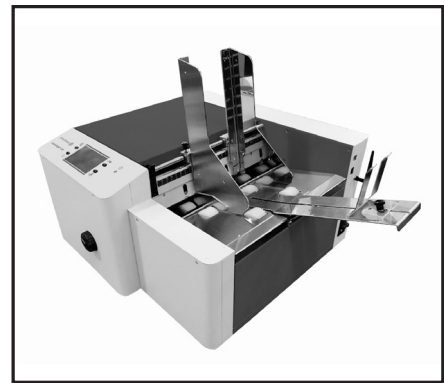
PB AddressRight 200 Envelope Printer

ADDRESSRIGHT 200 FIXED HEAD ADDRESSING PRINTER: The AddressRight® 200 envelope printer can print up to 22,000 #10 envelopes per hour, optimizing performance