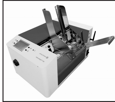
PB AddressRight 100 Envelope Printer

ADDRESSRIGHT 100 FIXED HEAD ADDRESSING PRINTER: The AddressRight® 100 envelope printer can print up to 22,000 #10 envelopes per hour, optimizing performance