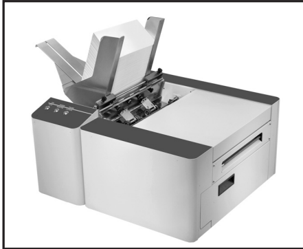
Quadiant MACH 5 Digital Color Printer

productivity dramatically, but it is very cost-efficient as well. The five ink tanks each hold 250 ml of ink for long job runs and keep cost per piece as low as possible. Compared to existing systems, the MACH 5 can run 3 times longer on a set of ink tanks that cost substantially less than toner. The MACH 5 does this all without any fragile drums or fuses to replace. The no-contact print technology won't emboss envelopes and can be used with any windowed envelope — not just the costly laser-safe kind. Moreover, the company's specially formulated ink can print on coated stocks. Combined with optional mColor RIP & Workflow software, the result is professional level color control. It incorporates color management tools, product job presets, hot folders and the powerful Harlequin RIP engine into a single workflow product.