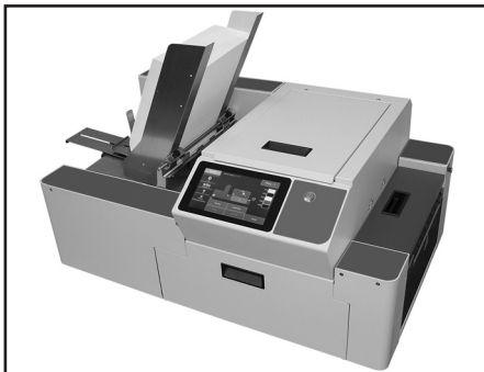
Quadiant MACH 6 Digital Color Printer

cardboard, flat cartons and much more. In fact, it can print on material up to 3/8" thick with the height-adjusting service station. Like the previous generation, the MACH 6 is capable of printing full color graphics and variable data and has two print modes. Normal mode runs at 60 feet per minute and 1600x800 dots per inch for faster production and less ink utilization. Best mode allows for 30 feet per minute and 1600x1600 dpi for higher output quality. The MACH 6 also continues to deliver the same low total cost of ownership and extraordinary profitability and productivity. Combined with optional mColor RIP & Workflow software, the result is professional level color control. mColor incorporates color management tools, production job presets, hot folders and the powerful Harlequin RIP engine into a single workflow product. It delivers predictable and repeatable standardization of color and improves overall image output quality.