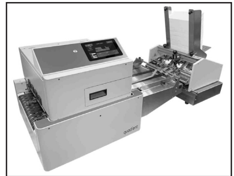
Quadiant MACH 7

MACH 9DS: The Quadiant MACH 9DS is an intelligent and dynamic inline color inkjet envelope printing system. More than just a printer, the MACH 9DS is a technology system that includes a fully automated, full color inkjet HP print engine, a heavy duty vacuum transport, a powerful Dell PC with Intel Core vPro processor and an intelligent software management system called MACH Symphony. Create brilliant, custom envelopes with variable graphics all in the same run. It delivers the color consistency required by creative and production-oriented users. The MACH 9DS integrates seamlessly with Quadiant's production-level DS folder inserters to supercharge your workflow and provide fast, dynamic, matched print finishing for inserted materials. It adjusts to thickness on the fly and optimizes speed to complete jobs faster in fewer steps with less labor.