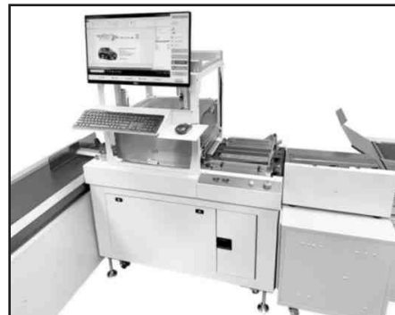
Quadiant MACH 9DS

MACH 9DS: The Quadiant MACH 9DS is an intelligent and dynamic inline color inkjet envelope printing system. More than just a printer, the MACH 9DS is a technology system that includes a fully automated, full color inkjet HP print engine, a heavy duty vacuum transport, a powerful Dell PC with Intel Core vPro processor and an intelligent software management system called MACH Symphony. Create brilliant, custom envelopes with variable graphics all in the same run. It delivers the color consistency required by creative and production-oriented users. The MACH 9DS integrates seamlessly with Quadiant's production-level DS folder inserters to supercharge your workflow and provide fast, dynamic, matched print finishing for inserted materials. It adjusts to thickness on the fly and optimizes speed to complete jobs faster in fewer steps with less labor.