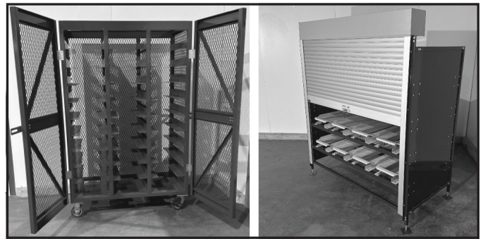
NEW Secure TrayTruker and Secure Tray Rack for mail-in ballots