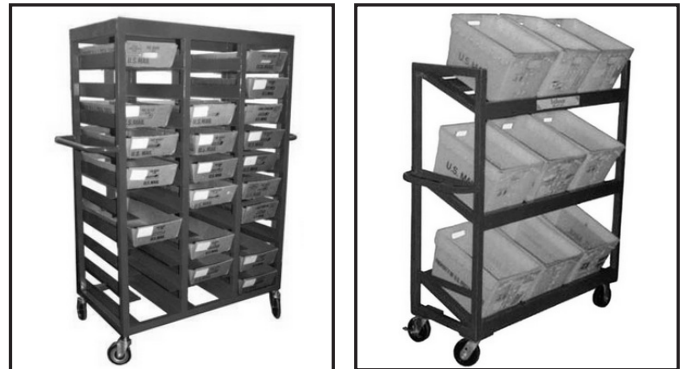
The TrayTruker (left) and TubTruker from Mail Automation, Inc.

It measures 46" long x 71" high x 25" wide. Use different colors to differentiate mail.