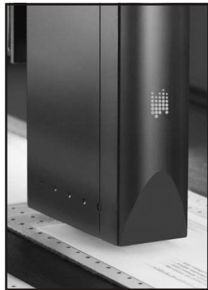
KODAK Versamark DS5220

KODAK VERSAMARK DS5220 AND DS5222 PRINTING SYSTEMS: The Kodak Versamark DS5220 and DS5222 Printing Systems,