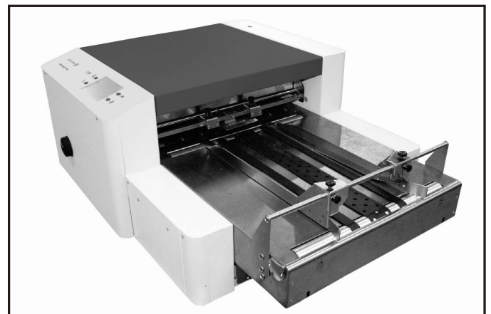
PB AddressRight 300 Envelope Printer

solutions, such as, ConnectRight™ Mailer to help you cleanse your address list ensuring delivery to your target customer and take advantage of pre-sort discounts.