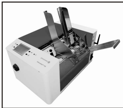
PB AddressRight 100 Envelope Printer

The AddressRight® 100 envelope printer can print up to 22,000 #10 envelopes per hour, optimizing performance and saving costs along the way. The printer connects easily to an existing network allowing for print job processing on any computer. This system offers spot color as well as extensive fonts and graphics to make the mail piece as creative as you want it to be. The AddressRight 100 printer handles multiple media sizes up to 1/4" thick, prints in four print qualities, and works with our Envelope Design tool, which allows you to create your own design and view the envelope image on screen. It is also small enough to fit in an office or mailroom environment. Use the AddressRight 100 in tandem with one of our mail management software solutions, such as, ConnectRight™ Mailer to help you cleanse your address list ensuring delivery to your target customer and take advantage of presort discounts.