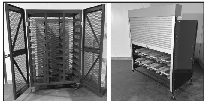
NEW Secure TrayTrucker and Secure Tray Rack for mail-in ballots

CONTACT: For more about Pitney Bowes, visit PitneyBowes.com.