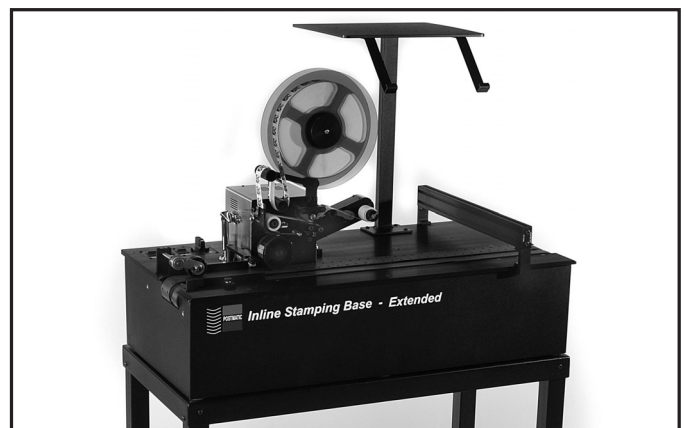
Postmatic Inline Stamp Affixing System

INLINE DIVERT SYSTEM: Postmatic has a complete line of Inline Divert Bases in lengths of 16", 24" & 48" long and available in Left to Right or Right to Left feed configurations. Handles up to 10x13 pieces and has Dry Contact, Electro-mechanical gate actuation. Great for use with Camera Systems or other controlling devices.