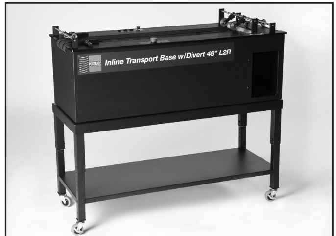
Postmatic Inline Divert System

COMPANY: Postmatic, 711 Weaver Blvd, Anoka, MN 55303 Phone: (763)-784-6046. Email: info@postmatic.net Contact: Sales. Web: www.postmatic.net.