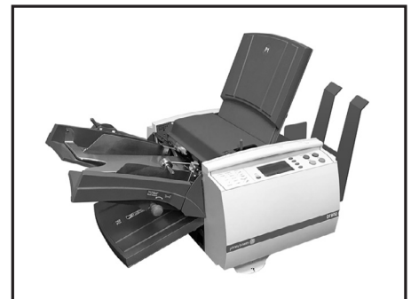
Pitney Bowes DF800 OfficeRight™ Folder

small footprint allows you to increase productivity by eliminating manual folding almost anywhere in your office. You can choose from 7 standard folding options, set up jobs in no time using built-in wizards and preset and set up to 20 jobs, making it easy for anyone to operate. The DF800