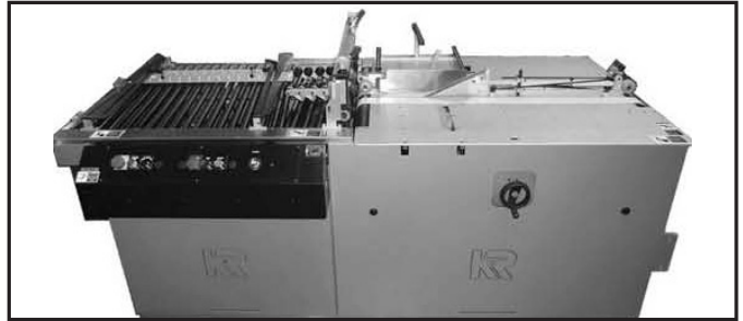
Kirk-Rudy KR219RRSF Roller Registration Score Folding System

tight fold. An all timing belt drive reduces parts wear and maintenance. Use the KR 516 in-line with most major brands of addressing and inserting systems.