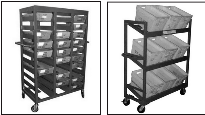
The TrayTruker (left) and TubTruker from Mail Automation, Inc.

and efficiently stores mail during inserting, metering or presorting. Easy to use and durable. Available in your choice of colors. Stores 9 tubs; durable steel construction; small footprint -- 48" long x 58" high and 20# wide.