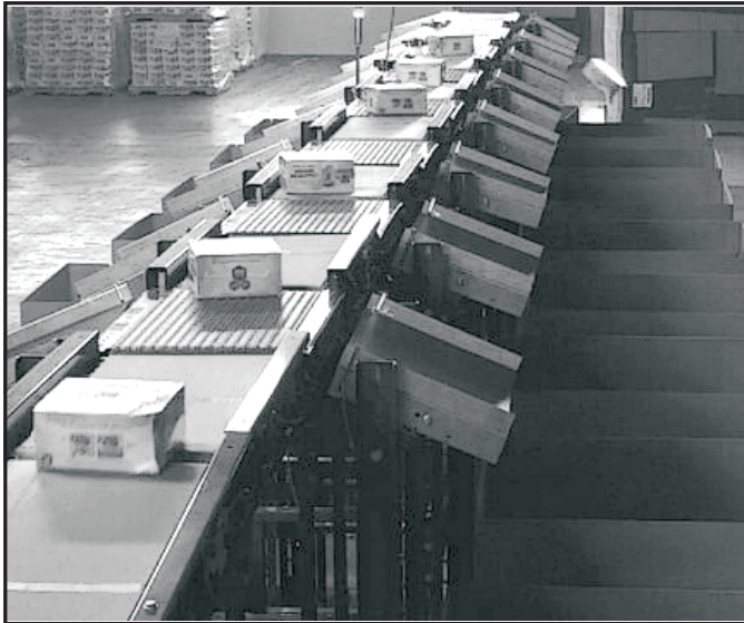
MAI Parcel Handling Sortation Systems

CONTACT: For more information call 1-800-350-6450 or email sales@eii-online.com .