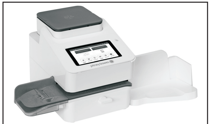
Pitney Bowes SendPro C Lite