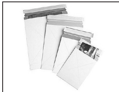
Supremex Enviro-Logix Flat Mailers

ENVIRO-LOGIX™ FLAT MAILERS: Our Enviro-LogiX™ Flat Mailers provide dimensional stability with a rigid construction and 'X' shaped scoring pattern on the back for improved contents protection. They are made from FSC® certified white paperboard, are 100% recyclable and feature a Peel 'n' Seal closure & E.Z. Open Tear String.