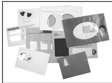
Supremex Custom & Stock Envelopes