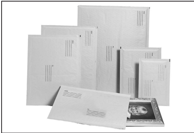
Alliance Bubble Mailers