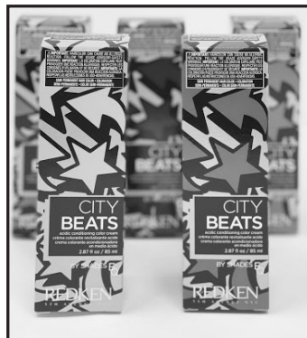
Supremex Folding Carton

FOLDING CARTON: We provide CPG, Pharmaceutical and Food brand owners and co-packers with premium quality, gorgeously decorated paperboard folding cartons for retail applications. Our folding carton solutions are based on innovative design, worldwide paperboard sourcing, state of the art traditional and UV lithographic printing and coatings, high speed blanking and consistent and reliable folding and gluing.