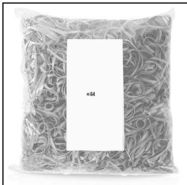
Alliance Rubber Co. Rubber Bands

DESCRIPTION: Alliance is a proud US Manufacturer of Rubber Bands for the United States Postal Service. The US Postal Service made