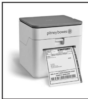
NEW PitneyShip™ Cube

COMPANY: Pitney Bowes Inc., 3001 Summer Street, Stamford, CT 06926-0700. Tele: 877-682-7687. Web: PitneyBowes.com