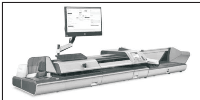
Quadient iX-9 with S.M.A.R.T.

iX-9 WITH S.M.A.R.T. FEATURES: When powered by S.M.A.R.T.® mail center software, the iX-9 transforms into your powerful partner, creating a consolidated and organized epicenter that streamlines workflows and reduces equipment footprint. S.M.A.R.T.® combines essential mail center operations into a powerful, user-friendly, all-in-one solution. The complete system, which includes a 21" all-in-one PC, thermal label printer, and wire-