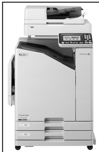
Riso ComColor® Series Printers

RISO COMCOLOR® SERIES HIGH SPEED PRINTERS: Increase the productivity and efficiency of your print operation with heatless,