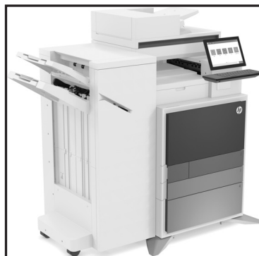
HP LaserJet E877 Series

HP LASERJET E877 PRINTER SERIES: Pitney Bowes partnered with HP to bring you the latest in color LaserJet technology. Meet the HP