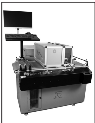
Kirk-Rudy FireJet 4C

KR FIREJET 4C: Kirk-Rudy's most recent innovation is an all-in-one printing system that combines the heavy-duty transport they are famous