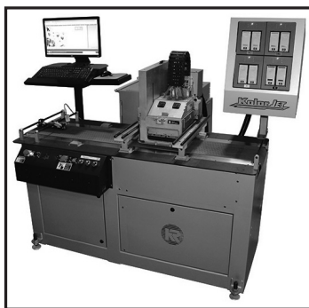
KRC500 Kolor Jet Printer

make the FireJet and all-in-one Digital Color Press capable of producing direct mail, variable data forms and high quality color envelopes.