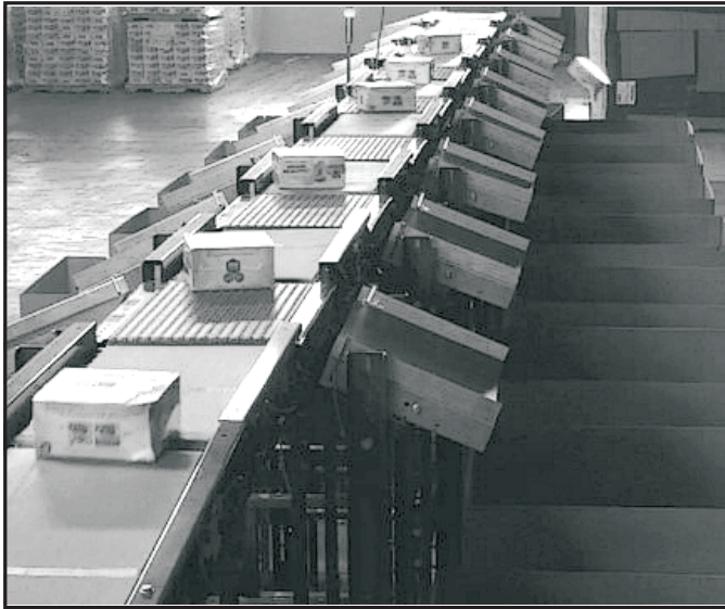
MAI Parcel Handling Sortation Systems

CONTACT: For more information call 1-800-350-6450 or email sales@eii-online.com .