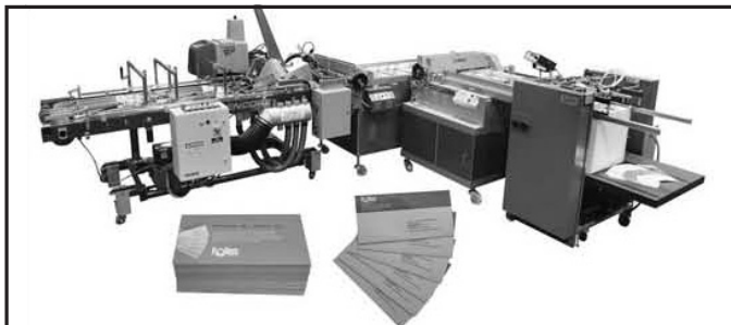
Rollem's Mailstream Direct Mail Finishing System

CONTACT: For more information call 877-682-7687 or visit Pitney Bowes at PitneyBowes.com .