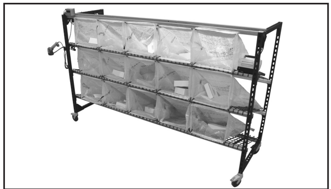
Engineering Innovation's LightSort

LIGHTSORT SYSTEM DESCRIPTION: The LightSort Sorting System uses light technology for expedited processing. Our low-cost systems easily integrate into existing processes to improve accuracy, productivity, and data tracking. LightSort technology is used to create fixtures that are low maintenance, durable, and easy to move for reconfiguration and storage. Quick assembly and intuitive use has operators up to speed in no time, efficiently sorting or filling orders and tracking data using the hands-free ring scanner. With LightSort, Eii proves again that expensive automation is not always the optimal approach. LightSort Technology utilizes low cost equipment to help operators do their job more quickly with reduced human error.