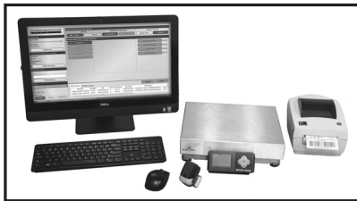
Engineering Innovation's Super Champ

The Champ is IMpb-compliant across the range of USPS Commercial Parcels, handling all types of Priority Mail as well as Ground Advantage, Bound Printed Matter, Parcel Select, Parcel Select Lightweight and Media/ Library Mail. The Super Champ upgrade enables quick address validation with IMpb compliance through an ergonomically friendly mobile OCR ring scanner that scans the address on the mail piece for USPS delivery point validation.