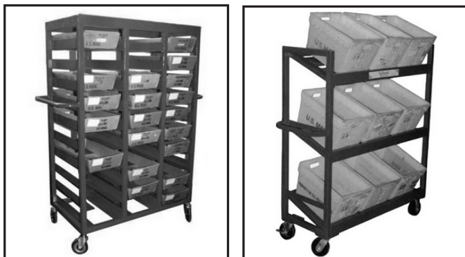
The TrayTruker (left) and TubTruker from Mail Automation, Inc.

trays. Accessible from either side. Durable steel construction. It measures 46" long x 71" high x 25" wide. Use different colors to differentiate mail.