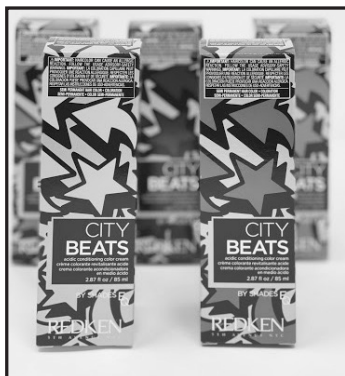
Supremex Folding Carton

shaped scoring pattern on the back for improved contents protection. They are made from FSC® certified white paperboard, are 100% recyclable and feature a Peel 'n' Seal closure & E.Z. Open Tear String.