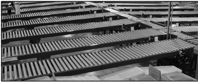
Mail Automation Inc.'s Mail Tray Conveyor Systems

Our product lines encompass both commercial and USPS applications. The company provides customized Tray Management Systems for First Class, Standard letters and flats. It provides standardized product lines as well as custom solutions that utilize conveyors to move trays, parcels, and flats along processing and sorting schemes to final dispatch.