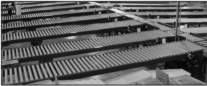
Mail Automation Inc.'s Mail Tray Conveyor Systems

Our product lines encompass both commercial and USPS applications. The company provides customized Tray Management Systems for First Class, Standard letters and flats. It provides standardized product lines as well as custom solutions that utilize conveyors to move trays, parcels, and flats along processing and sorting schemes to final dispatch.