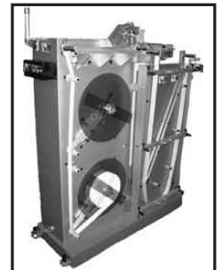
KR565 Splicing Unit

KR 565 LABEL SPLICING UNIT: Designed to provide nonstop, uninterrupted labeling when used with Kirk-Rudy tabbers. The continuous feed dual unwind acts as a stand-alone standard loose-loop powered unwind unit. When the supply roll unwinds to a certain level, a sensor activates a warning light and signals the drive to feed the remaining labels into a holding bin. The second roll of labels is then spliced to the end of the web as the labels in the bin are consumed.