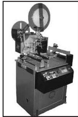
KR440 Mini Tabber

KR 440 MINI TABBER: The KR 440 is Kirk-Rudy's newest and most affordable tabbing system yet. Priced thousands less than comparable systems, the KR 440 utilizes many of the same features that made the KR 540 a bestseller. Key features like side register belts, side-to-side top plate adjustment and automatic tab sensor setup keeps the tabbing process con-