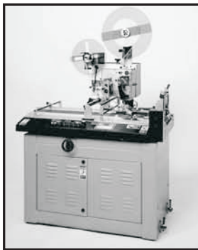
Kirk-Rudy KR540 Tabber

KR 540 TABMASTER: The KR 540 makes tabbing of paper products faster and easier than ever. A straight forward operator interface simplifies operator training and setup while industry standard motors and controls make the KR 540 simple to operate and economical to maintain. All major types of tabs as well as pressure-sensitive stamps and labels of various shapes and sizes can be placed on a wide variety of products. Right or left edge tabbing, bump turn attachments, wide and fan-folded label kits along with a folder interface conveyor option make the KR 540 a flexible system.