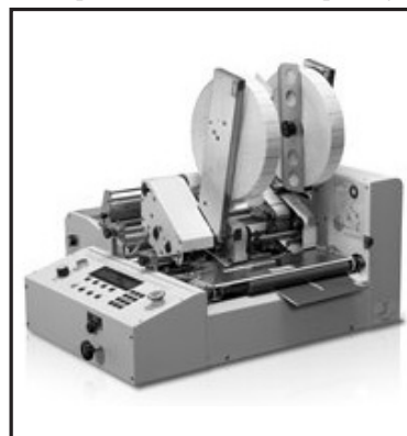
Pitney Bowes W360 Tabber System

W360 MULTIFUNCTION TABBER SYSTEM: The W360 Multifunction Tabber System has some of the most advanced features for a tabletop model and it has the capability to meet all the latest USPS regulations in order to benefit from automated postal discounts.