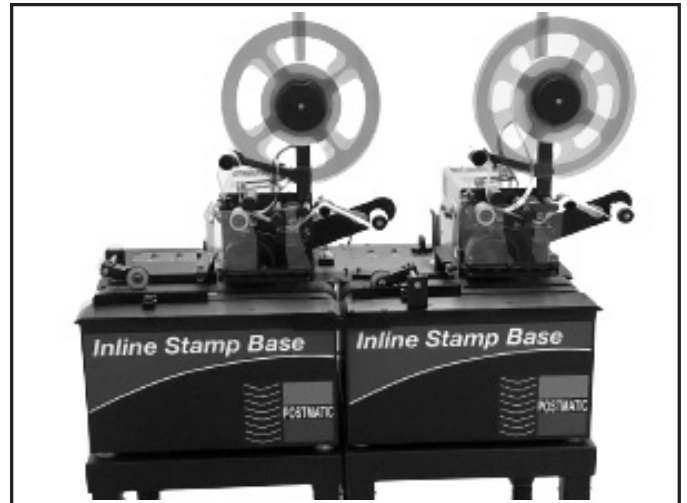
Postmatic Inline Stamping System

DESCRIPTION: Postmatic Inline Stamping Base & Stamp Affixer will affix US and Canadian postage stamps from coils of 3,000 or 10,000 at speeds up to 28,000 per hour with dual capabilities. Commonly used in line with high-speed inserters including the Flowmaster & BH inserters. The Postmatic Dual Stamping System enriches the classic standard