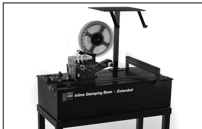
Postmatic Inline Stamp Affixing System

INLINE DIVERT SYSTEM: Postmatic has a complete line of Inline Divert Bases in lengths of 16", 24" & 48" long and available in Left to Right or Right to Left feed configurations. Handles up to 10x13 pieces and has Dry Contact, Electro-mechanical gate actuation. Great for use with Camera Systems or other controlling devices.