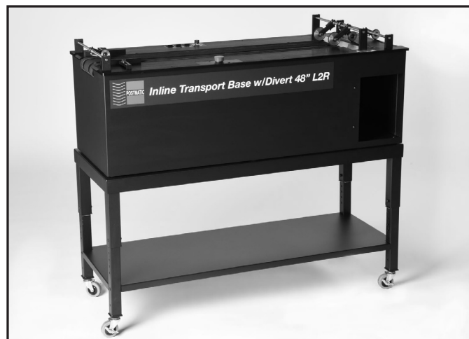
Postmatic Inline Divert System

CONTACT: For more information, call 770-427-4203 or email info@kirk Rudy.com .