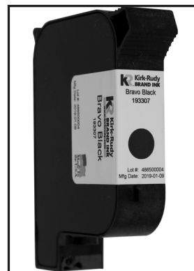
Kirk-Rudy Brand ink cartridges.

COMPANY: Kirk-Rudy, Inc., 125 Lorraine Parkway, Woodstock, GA 30188. Key Contact: Sales Email: info@kirkrudy.com . Phone: 770-427-4203.