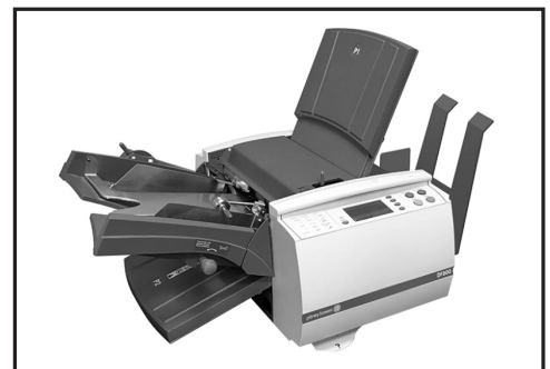
Pitney Bowes DF800 OfficeRight™ Folder

DF800 FOLDING SYSTEM: The DF800 can fold up to 13,000 pieces per hour. This single compact system handles many folding needs. Its small footprint allows you to increase productivity by eliminating manual folding almost anywhere in your office. You can choose from 7 standard folding options, set up jobs in no time using built-in wizards and preset and set up to 20 jobs, making it easy for anyone to operate. The DF800 folder handles paper weights from 14 lbs. to 32 lbs., and paper sizes from 5"x5" to 9"x16". Choose the ideal fold for your job from seven popular options: