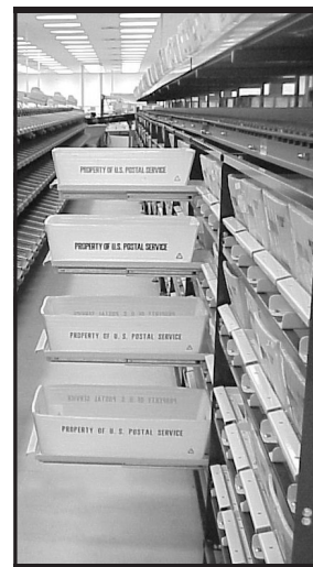
Sorter Tray Racks

DESCRIPTION: Mail Automation Inc. designs, engineers, manufactures and implements a variety of Sorter Tray Rack solutions for the mailing marketplace. Our product lines encompass both commercial and USPS applications. We provide customized as well as standard Sorter Tray Racks for First Class and Standard letters. Our models are built specifically to meet your needs whether it is our fixed drawer and shelf-style EconoRak or our pull-out drawer and pull-out shelf style which are specifically built to match the pockets in your high-speed sortation equipment.