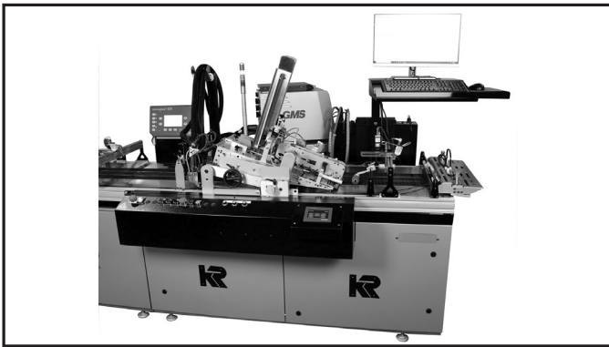
Kirk-Rudy KR497T Servo Attaching System