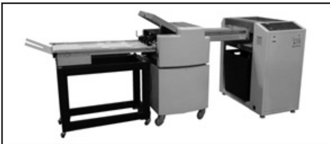
Spedo OPERAM Pressure Seal Solution