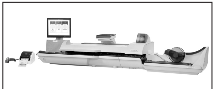
Pitney Bowes SendPro P3000 Mailing & Shipping System

SENDPRO® P-SERIES (P1000, P2000, and P3000): Efficiently process high-volumes of mail and packages at high speeds with built-in technologies that optimize your mailing, shipping, and tracking workflow, all while saving you significant time and money. Pitney Bowes offers 3 models to choose from: P1000, P2000, and P3000, all of which come with automatic, fast, and reliable mail processing speeds up to 310 letters per minute, a large, color touchscreen display to quickly and easily access all sending applications. Weigh and process mixed-sized mail, up to 5/8" thick, in a single pass at speeds of up to 205 letters per minute with the Pitney Bowes proprietary technology, Weigh-On-The-Way® on the P2000 and P3000 models. Integrated PitneyShip™ software technology with optional multi-carrier shipping access allows desktop shipping, tracking and more from your device or any computer. Complies with the latest USPS IMI rule Federal Register 85 FR 78234.