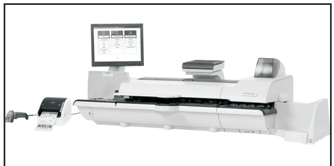
Pitney Bowes SendPro P2000 Mailing & Shipping System