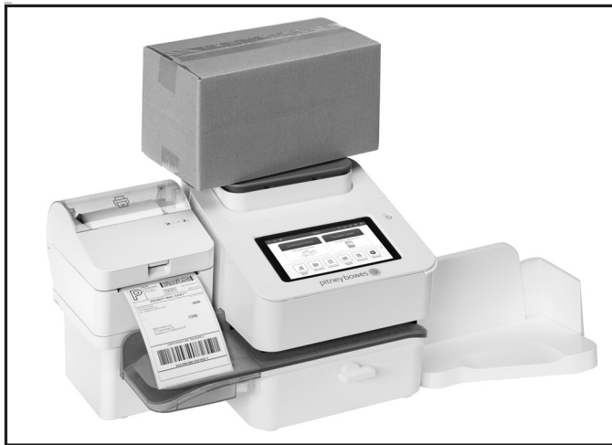
Pitney Bowes SendPro+