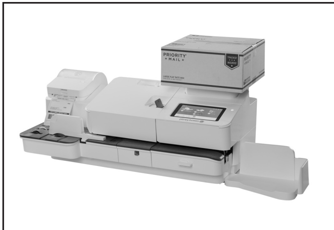
Pitney Bowes SendPro C Auto

display. Complies with the latest USPS IMI rule Federal Register 85 FR 78234.