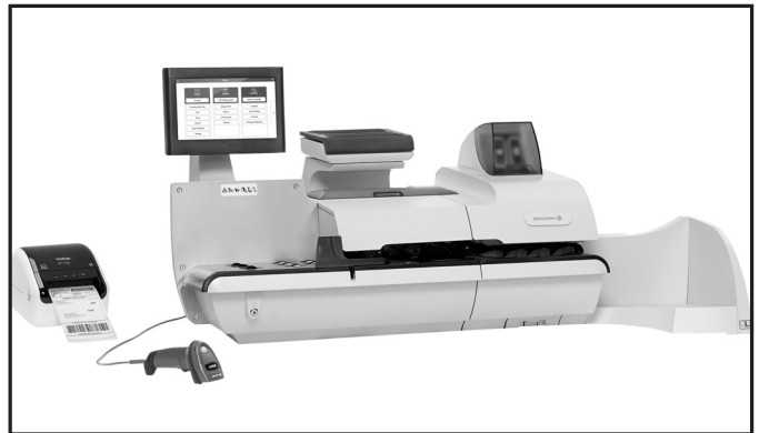
Pitney Bowes SendPro P1000 Mailing & Shipping System

SENDPRO® C AUTO: Simplify mailing with an automatic postage machine built for business. Process batches of letters, postcards and large envelopes quickly and easily with an automatic postage machine designed for busy mailrooms. The SendPro C Auto speeds mailing tasks with automated features that calculate postage costs, update rate changes and process mail batches at up to 120 letters per minute. And because high-tech shouldn't mean difficult, the 7" color touchscreen display makes viewing and selecting all your options as easy as possible. Complies with the latest USPS IMI rule Federal Register 85 FR 78234.