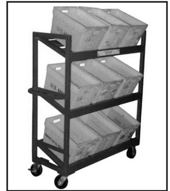
The TrayTruker (left) and TubTruker from Mail Automation, Inc.

trays. Accessible from either side. Durable steel construction. It measures 46" long x 71" high x 25" wide. Use different colors to differentiate mail.