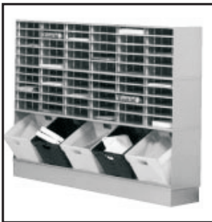
Pitney Bowes Risers & Sorters

CONTACT: For more information call 877-682-7687 or visit Pitney Bowes at PitneyBowes.com.