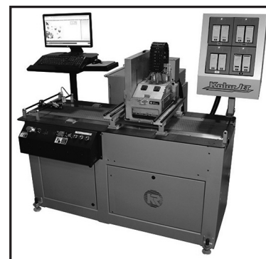
KRC500 Kolor Jet Printer

graphics, and variable data to envelopes and documents for more effective communication. The KRC500 KolorJet printer offers excellent color print quality at high speeds. Increase promotional effectiveness and response rates with high-speed, high-quality variable color added to envelopes and web-printed pages. Produce color images, graphics, and variable data 600 dpi at 500 fpm with four 4.25" printheads. Offering a low total cost of ownership, the KRC500 KolorJet Print Module is an affordable option for adding process color versus stand-alone equipment.