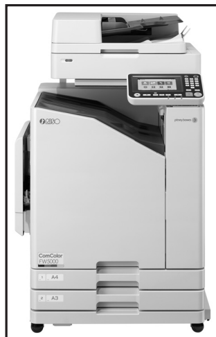
Riso ComColor® Series Printers

COMPANY: Pitney Bowes Inc., 3001 Summer Street, Stamford, CT 06926-0700. Tele: 877-682-7687. Web: PitneyBowes.com