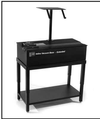
Inline Vacuum Transport Bases

COMPANY: Postmatic, 711 Weaver Blvd, Anoka, MN 55303 Phone: (763)-784-6046. Email: info@postmatic.net Contact: Sales. Web: www.postmatic.net .