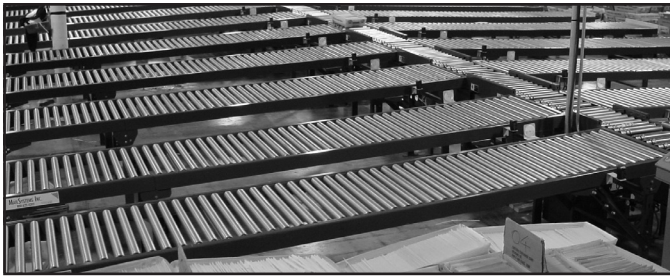
Mail Automation Inc.'s Mail Tray Conveyor Systems

Our product lines encompass both commercial and USPS applications. The company provides customized Tray Management Systems for First Class, Standard letters and flats. It provides standardized product lines as well as custom solutions that utilize conveyors to move trays, parcels, and flats along processing and sorting schemes to final dispatch.