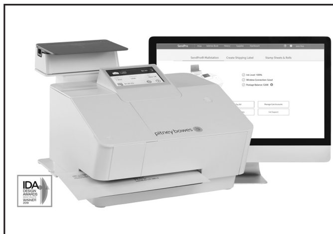
Pitney Bowes SendPro Mailstation