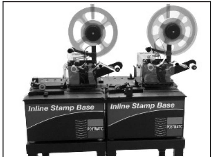
Postmatic Inline Stamping System

DESCRIPTION: Postmatic Inline Stamping Base & Stamp Affixer will affix US and Canadian postage stamps from coils of 3,000 or 10,000 at speeds up to 28,000 per hour with dual capabilities. Commonly used in line with high-speed inserters including the Flowmaster & BH inserters. The Postmatic Dual Stamping System enriches the classic standard