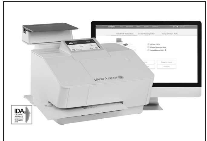
Pitney Bowes SendPro Mailstation