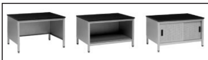
Pitney Bowes Standard Tables (top) and Modular Tables