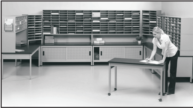
Pitney Bowes Furniture Solutions