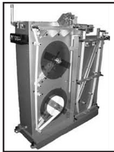
KR565 Splicing Unit

KR 565 LABEL SPLICING UNIT: Designed to provide nonstop, uninterrupted labeling when used with