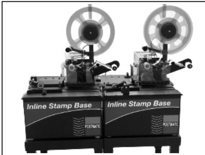
Postmatic Inline Stamping System

stamping system with multi-channel intelligent features. Reduce time of changing over coils and slowing down production by enabling one of the 3 features that are embedded in the new Dual Stamping System. Great for up to 6x9 or 10x13 size pieces and configured for Left to Right flow.