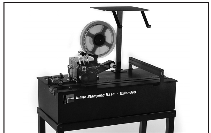
Postmatic Inline Stamp Affixing System

INLINE DIVERT SYSTEM: Postmatic has a complete line of Inline Divert Bases in lengths of 16", 24" & 48" long and available in Left to Right or Right to Left feed configurations. Handles up to 10x13 pieces and has Dry Contact, Electro-mechanical gate actuation. Great for use with Camera Systems or other controlling devices.