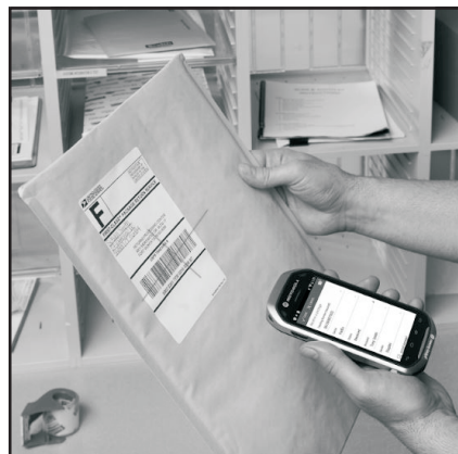
Pitney Bowes SendSuite® Tracking Online

SENDSUITE® TRACKING ONLINE: This cloud-based solution streamlines the logging, tracking and managing of incoming packages and