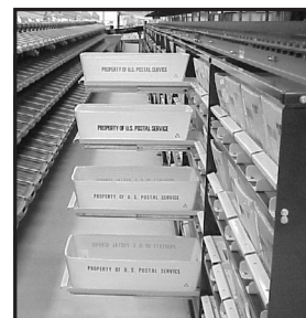
Sorter Tray Racks